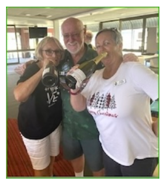
March 2024 Page 8 of 17